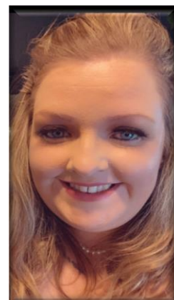
Level 3 Qualified Key Person